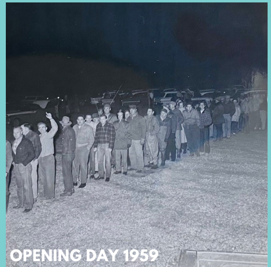
OPENING DAY 1959

Avoid a LONG wait by purchasing your annual fishing license before arriving at the park. Daily trout tags for March 1, 2021 are also for sale now at the reception building. In a hope to ease congestion in the building an "express tent" will be set up outside for purchase of daily tags only.