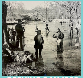
OPENING DAY 1959